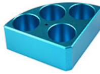
Blue quarter pie, 4 holes, 30mL reaction vessel, \varnothing 28\text{mm} , 30mm depth