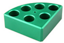
Green quarter pie, 6 holes, 8mL reaction vessel, \varnothing 17.8\text{mm} , 26mm depth