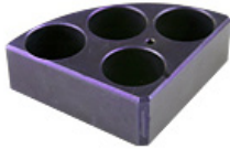
Purple quarter pie, 4 holes, 20 mL reaction vessel, \varnothing 28\text{mm} , 24mm depth