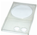
F101 protective cover, temperature resistance of 135^{\circ}\text{C}