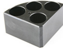
Black quarter pie, 4 holes, 40mL reaction vessel, \varnothing 28\text{mm} , 43mm depth