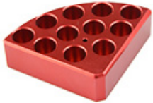
Red quarter pie, 11 holes, 4 mL reaction vessel, \varnothing 15.2\text{mm} , 20mm depth