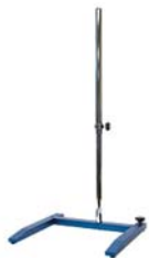
- KPT-1000TH Telescopic H-stand, 500 ~1,000mm Ident. No. K510009