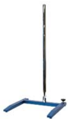
- KPT-1000H H-stand, 1,000mm Ident. No. K510008