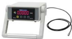
- DSM-5 Ident. No. K560001